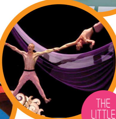
THE LITTLE RED